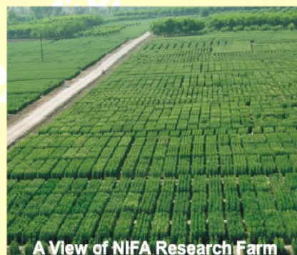
A View of NIFA Research Farm